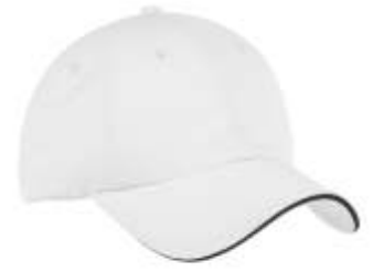
Port Authority® Dry Zone® Cap