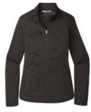
Port Authority® Ladies Diamond Heather Fleece Full-Zip Jacket