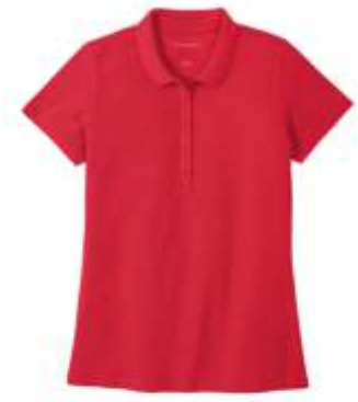
Port Authority® Ladies SuperPro React™ Polo