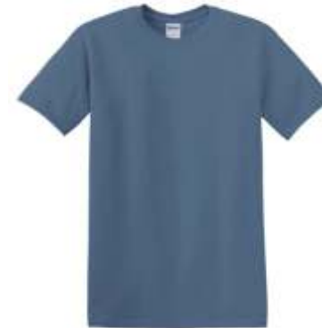
Gildan® - Heavy Cotton™ 100% Cotton T-Shirt