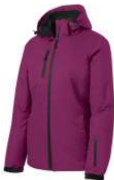
Port Authority® Ladies Vortex Waterproof 3-in-1 Jacket