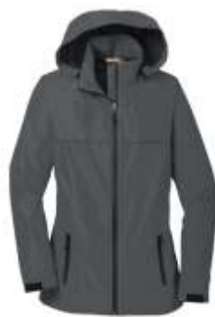
Port Authority® Ladies Torrent Waterproof Jacket