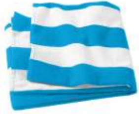
Port Authority® Cabana Stripe Beach Towel