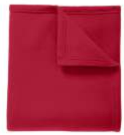
Port Authority® Core Fleece Blanket