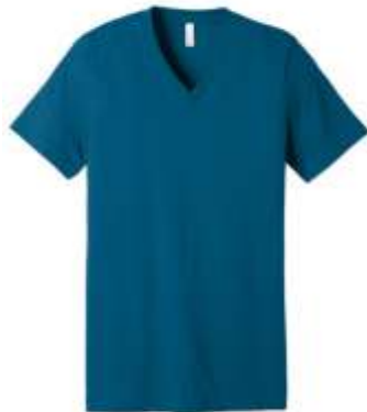
BELLA+CANVAS® Unisex Jersey Short Sleeve V-Neck Tee