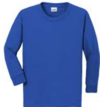
Gildan® Youth Heavy Cotton™ 100% Cotton Long Sleeve T-Shirt