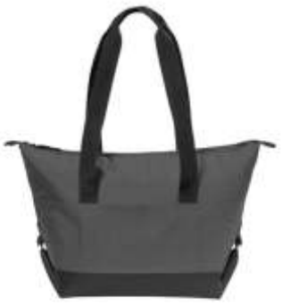
Port Authority® 18-Can Collapsible Cooler