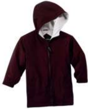
Port Authority® Youth Team Jacket