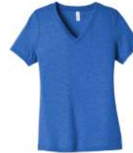
BELLA+CANVAS® Women's Relaxed Jersey Short Sleeve V-Neck Tee