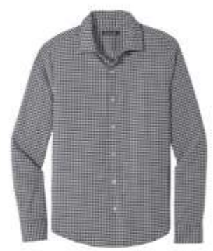
Port Authority® City Stretch Shirt