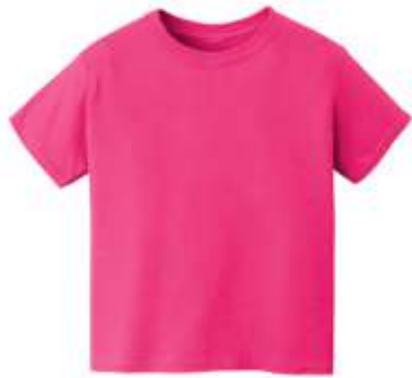
Gildan Youth Softstyle® T-Shirt