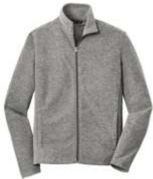
Port Authority® Heather Micro fleece Full-Zip Jacket