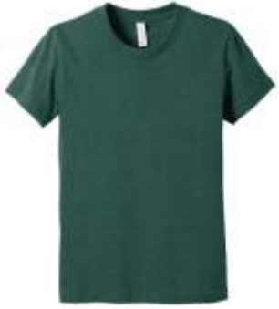
BELLA+CANVAS® Youth Jersey Short Sleeve Tee