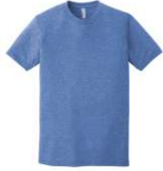
American Apparel® Tri-Blend Short Sleeve Track T-Shirt