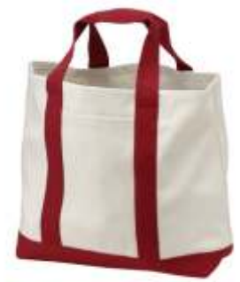
Port Authority® - Two-Tone Shopping Tote