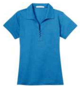
Port Authority® Ladies Tech Pique Polo