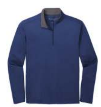
Port Authority® Silk Touch™ Performance 1/4-Zip