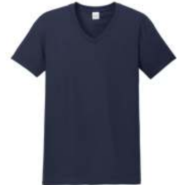
Gildan Softstyle® V-Neck T-Shirt