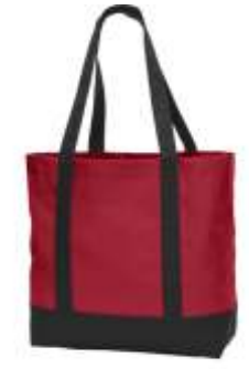
Port Authority® Day Tote