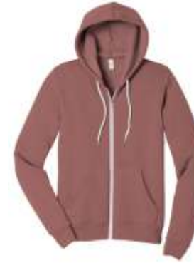
BELLA+CANVAS® Unisex Sponge Fleece Full-Zip Hoodie