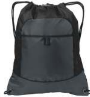
Port Authority® Pocket Cinch Pack