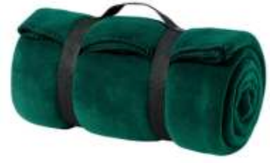
Port Authority® - Value Fleece Blanket with Strap