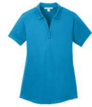
Port Authority® Ladies Diamond Jacquard Polo