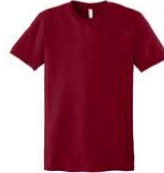
American Apparel® USA Collection Fine Jersey T-Shirt