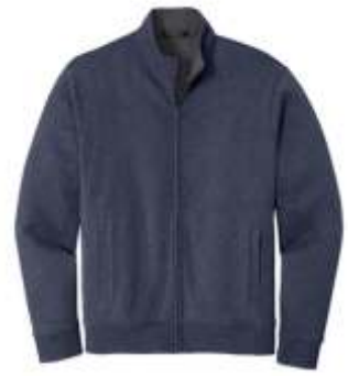
Port Authority® Interlock Full-Zip