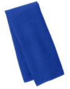
Port Authority® Waffle Microfiber Fitness Towel