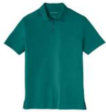
Port Authority® City Stretch Polo