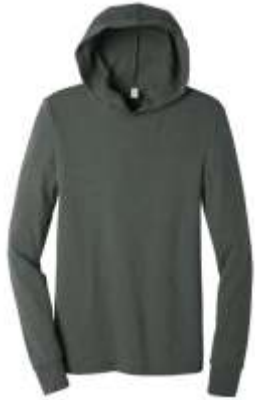
BELLA+CANVAS® Unisex Jersey Long Sleeve Hoodie