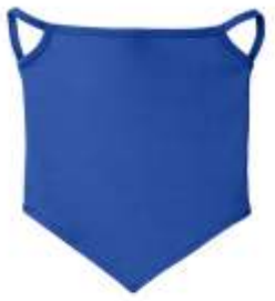
Port Authority® Ear Loop Gaiter Mask