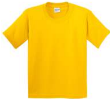
Gildan® - Youth Heavy Cotton™ 100% Cotton T-Shirt