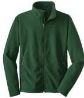
Port Authority® Youth Value Fleece Jacket