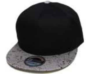
Cookies & Cream Brim Snapback