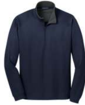
Port Authority® Vertical Texture 1/4-Zip Pullover