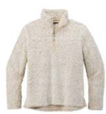
Port Authority® Cozy 1/4-Zip Fleece