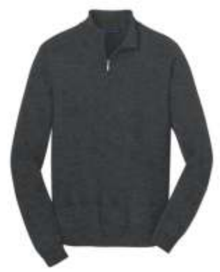
Port Authority® 1/2-Zip Sweater