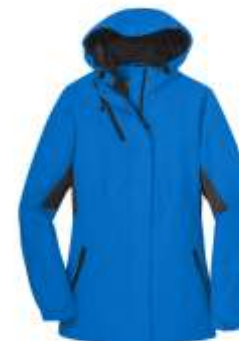
Port Authority® Ladies Cascade Waterproof Jacket