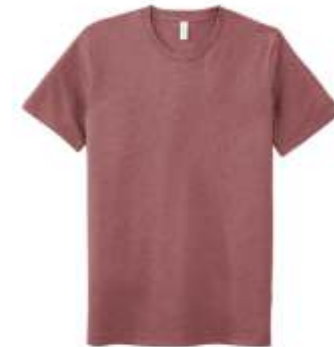
BELLA+CANVAS® Unisex Sueded Tee