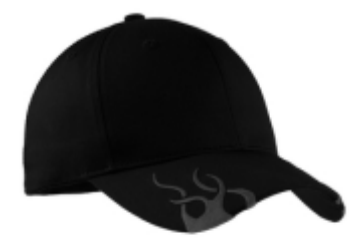
Port Authority® Racing Cap with Flames