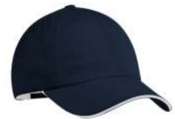
Port Authority® Sandwich Bill Cap