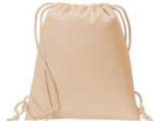
Port Authority® Cotton Cinch Pack