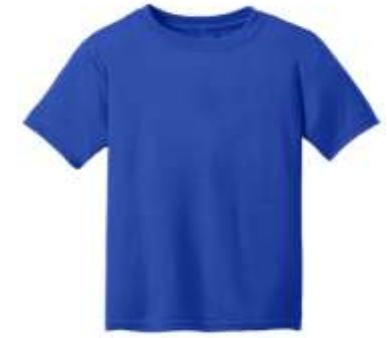
Gildan® Youth Gildan Performance® T-Shirt