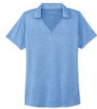
Port Authority® Ladies Shadow Stripe Polo