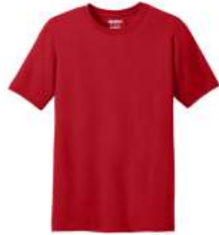
Gildan® Gildan Performance® T-Shirt