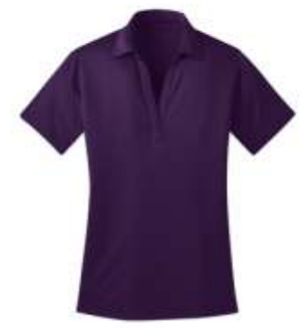
Port Authority® Ladies Silk Touch™ Performance Polo