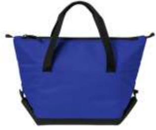
Port Authority® 6-Can Collapsible Cooler