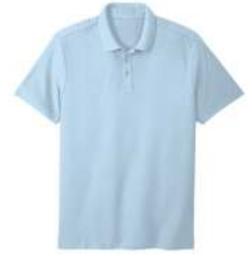
Port Authority® SuperPro React™ Polo