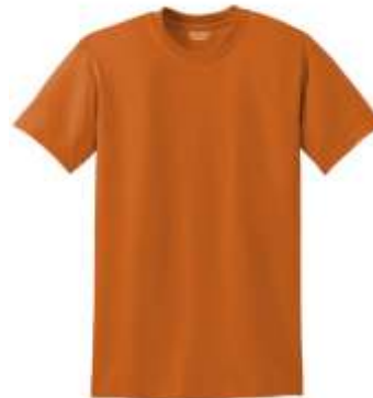
Gildan® - DryBlend® 50 Cotton /50 Poly T-Shirt