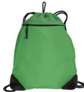
Port Authority® - Cinch Pack with Mesh Trim