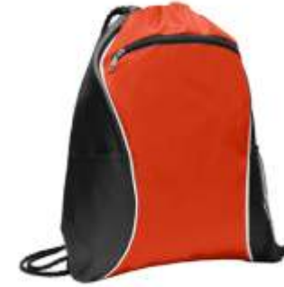
Port Authority® Fast Break Cinch Pack