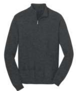
Port Authority® 1/2-Zip Sweater