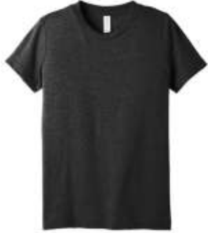
BELLA+CANVAS® Youth Triblend Short Sleeve Tee