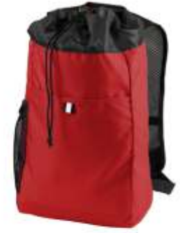
Port Authority® Hybrid Backpack