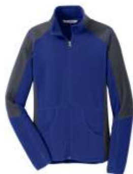
Port Authority® Ladies Colorblock Microfleece Jacket