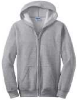
Gildan® Youth Heavy Blend™ Full-Zip Hooded Sweatshirt

8-ounce, 50/50 cotton/poly Double-needle stitching at waistband and cuffs Unlined hood No drawcord at hood