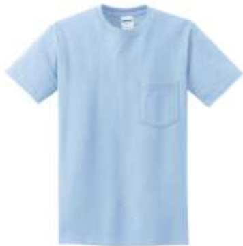
Gildan® - Ultra Cotton® 100% Cotton T-Shirt with Pocket