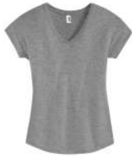
Anvil® Ladies Tri-Blend V-Neck Tee