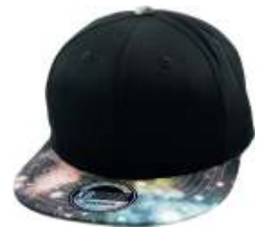
Galaxy Brim Snapback