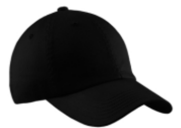
Port Authority® Porflex® Unstructured Cap