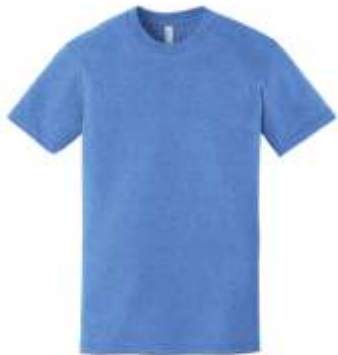
American Apparel® Poly-Cotton T-Shirt