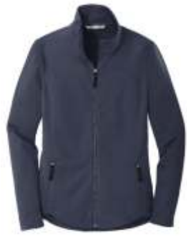
Port Authority® Ladies Collective Smooth Fleece Jacket