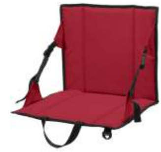
Port Authority® Stadium Seat