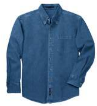
Port Authority® City Stretch Shirt