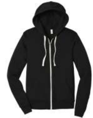
BELLA+CANVAS® Unisex Triblend Sponge Fleece Full-Zip Hoodie