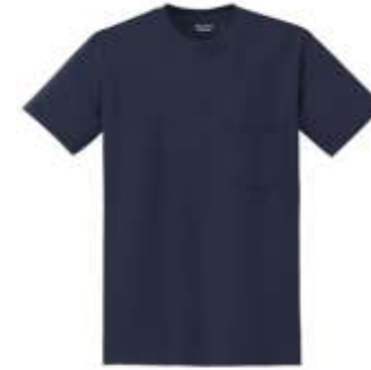
Gildan® - DryBlend® 50 Cotton /50 Poly Pocket T-Shirt