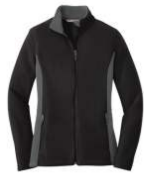
Port Authority® Ladies Eclipse Stretch Polo