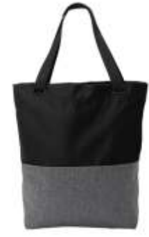
Port Authority® Access Convertible Tote