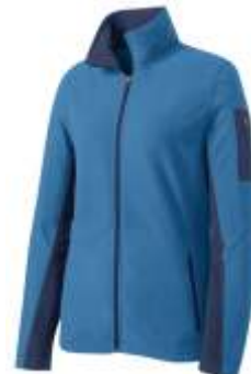
Port Authority® Ladies Summit Fleece Full-Zip Jacket