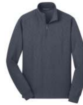
Port Authority® Slub Fleece 1/4-Zip Pullover