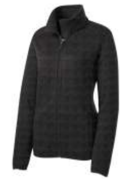
Port Authority® Ladies Sweater Fleece Jacket