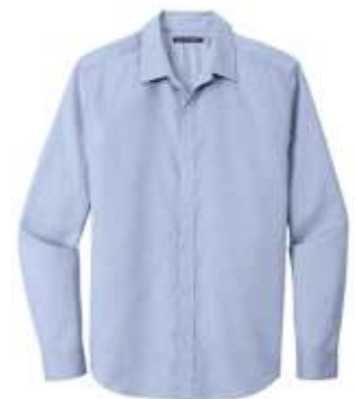
Port Authority® Pincheck Easy Care Shirt