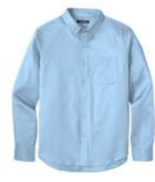
Port Authority® Long Sleeve SuperPro React™ Twill Shirt