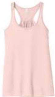
BELLA+CANVAS® Women's Flowy Racerback Tank