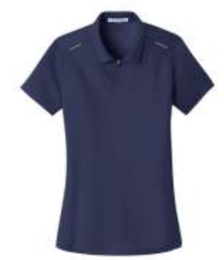
Port Authority® Ladies Pinpoint Mesh Zip Polo