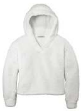
Port Authority® Ladies Cozy Fleece Hoodie