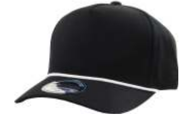
Vintage Baseball Cap