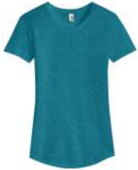
Anvil® Ladies Tri-Blend V-Neck Tee