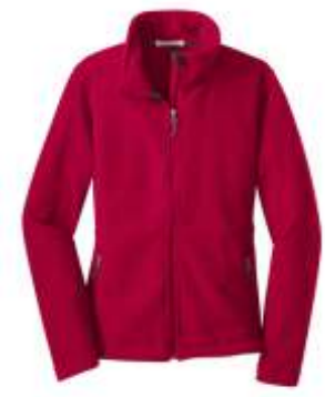
Port Authority® Ladies Value Fleece Jacket