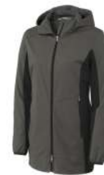
Port Authority® Ladies Active Hooded Soft Shell Jacket