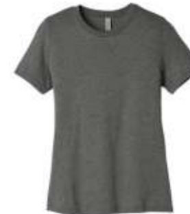
BELLA+CANVAS® Women's Relaxed Jersey Short Sleeve Tee