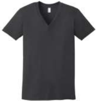
American Apparel® Fine Jersey V-Neck T-Shirt