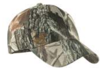
Port Authority® Pro Camouflage Series Cap