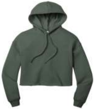
BELLA+CANVAS® Women's Sponge Fleece Cropped Fleece Hoodie