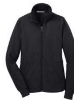
Port Authority® Ladies Slub Fleece Full-Zip Jacket