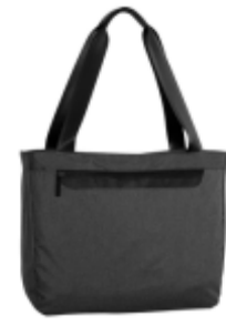
Port Authority® Exec Laptop Tote