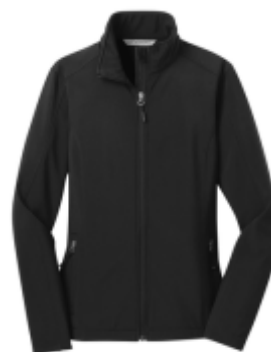
Port Authority® Ladies Core Soft Shell Jacket