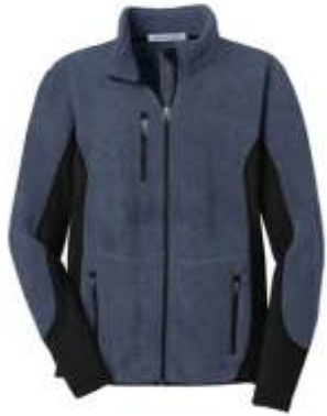
Port Authority® R-Tek® Pro Fleece Full-Zip Jacket