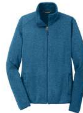
Port Authority® Sweater Fleece Jacket