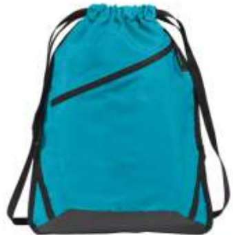
Port Authority® Zip-It Cinch Pack