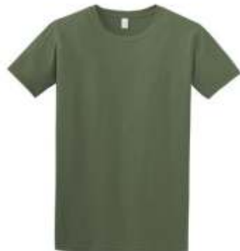
Gildan Softstyle® T-Shirt