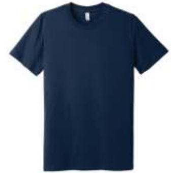
BELLA+CANVAS® Unisex Made In The USA Jersey Short Sleeve Tee