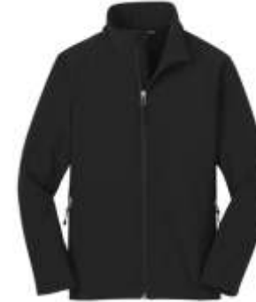
Port Authority® Youth Core Soft Shell Jacket