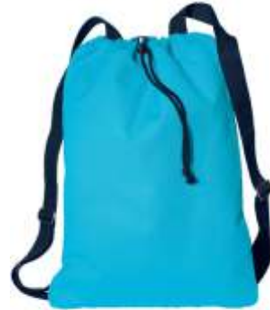
Port Authority® Canvas Cinch Pack