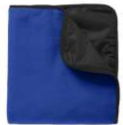
Port Authority® Fleece & Poly Travel Blanket