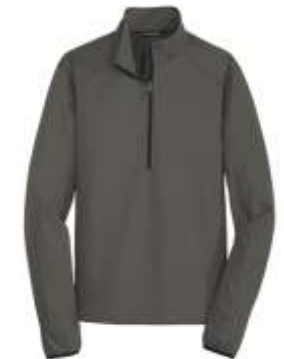
Port Authority® Active 1/2-Zip Soft Shell Jacket