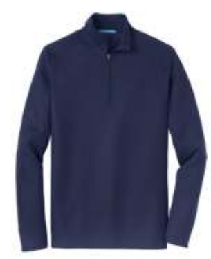
Port Authority® Pinpoint Mesh 1/2-Zip