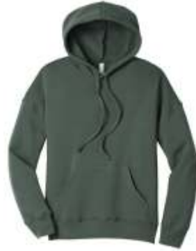
BELLA+CANVAS® Unisex Sponge Fleece Pullover DTM Hoodie