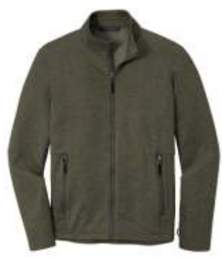
Port Authority® Collective Striated Fleece Jacket