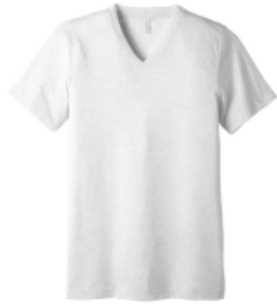
BELLA+CANVAS® Unisex Triblend Short Sleeve V-Neck Tee