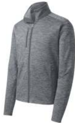
Port Authority® Digi Stripe Fleece Jacket