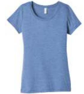
BELLA+CANVAS® Women's Triblend Short Sleeve Tee