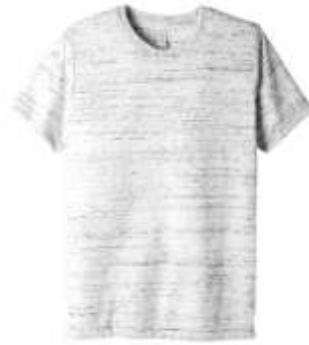
BELLA+CANVAS® Unisex Poly-Cotton Short Sleeve Tee