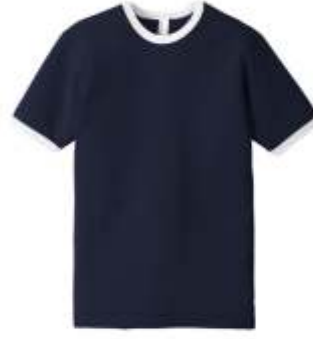
American Apparel® Fine Jersey Ringer T-Shirt