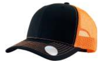
Classic 6 Panel Mesh Back