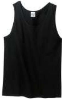
Gildan® - Ultra Cotton® Tank Top