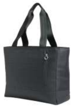
Port Authority® Ladies Laptop Tote