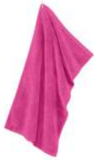
Port Authority® Grommeted Microfiber Golf Towel