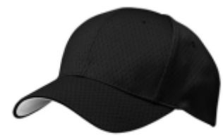
Port Authority® Pro Mesh Cap