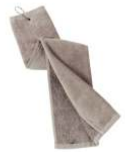
Port Authority® Grommeted Tri-Fold Golf Towel