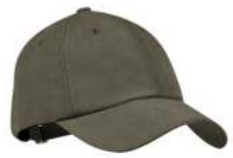
Port Authority® Sueded Cap