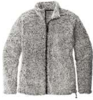
Port Authority® Ladies Cozy Fleece Jacket