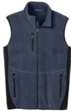
Port Authority® R-Tek® Pro Fleece Full-Zip Vest