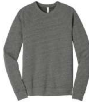
BELLA+CANVAS® Unisex Sponge Fleece Raglan Sweatshirt