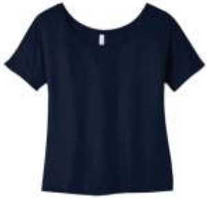
BELLA+CANVAS® Women's Slouchy Tee