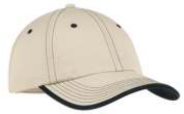
Port Authority® Vintage Washed Contrast Stitch Cap