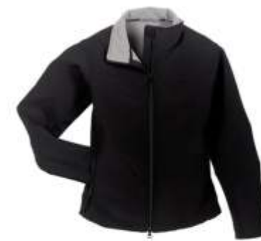
Port Authority® Ladies Glacier® Soft Shell Jacket