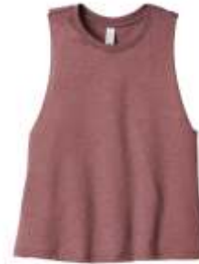
BELLA+CANVAS® Women's Racerback Cropped Tank