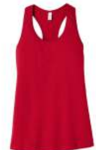
BELLA+CANVAS® Women's Jersey Racerback Tank