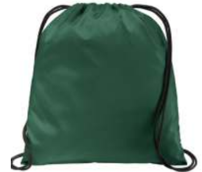
Port Authority® Ultra-Core Cinch Pack