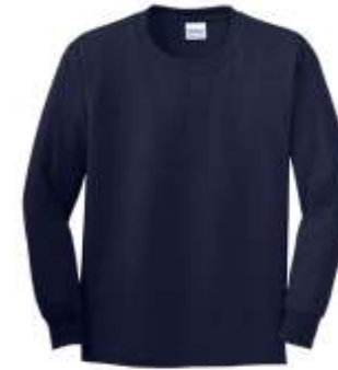
Gildan® - Youth Ultra Cotton® 100% Cotton Long Sleeve T-Shirt