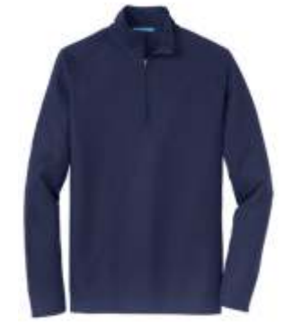
Gildan Softstyle® V-Neck T-Shirt