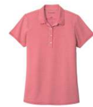
Port Authority® Ladies Gingham Polo