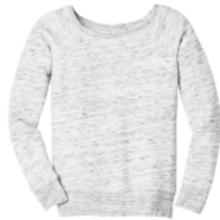
BELLA+CANVAS® Women's Sponge Fleece Wide-Neck Sweatshirt