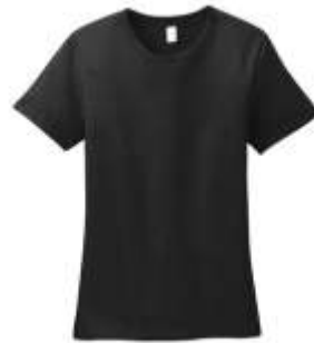
Anvil® Ladies 100% Ring Spun Cotton T-Shirt