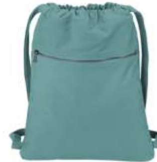
Port Authority® Beach Wash™ Cinch Pack