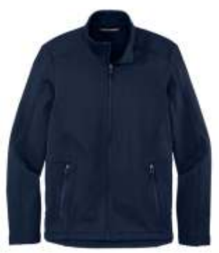
Port Authority® Grid Fleece Jacket