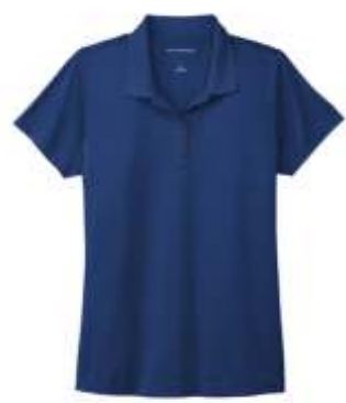
Port Authority® Ladies Eclipse Stretch Polo