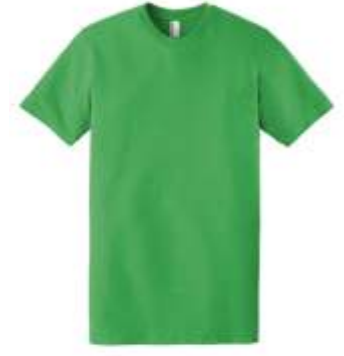
American Apparel® Fine Jersey T-Shirt