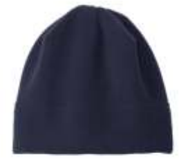
Port Authority® R-Tek® Stretch Fleece Beanie