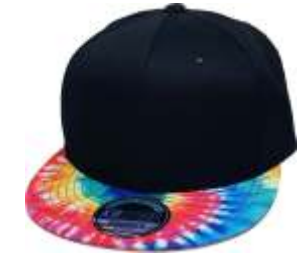
Tie Dye Brim Snapback