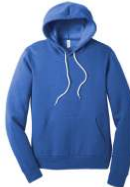
BELLA+CANVAS® Unisex Sponge Fleece Pullover Hoodie