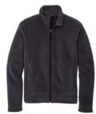
Port Authority® Ultra Warm Brushed Fleece Jacket