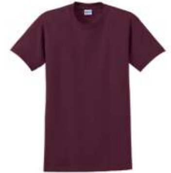
Gildan® - Ultra Cotton® 100% Cotton T-Shirt