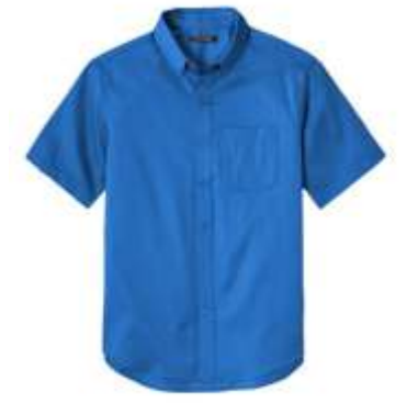
Port Authority® Short Sleeve SuperPro React™ Twill Shirt