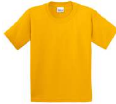
Gildan® - Youth Ultra Cotton® 100% Cotton T-Shirt