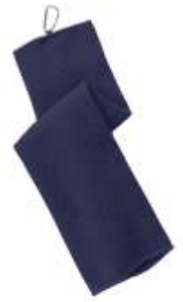
Port Authority® Waffle Microfiber Golf Towel