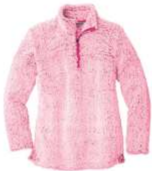
Port Authority® Ladies Cozy 1/4-Zip Fleece