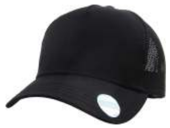
Classic 5 Panel Mesh Back