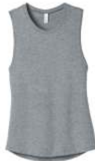
BELLA+CANVAS® Women's Jersey Muscle Tank