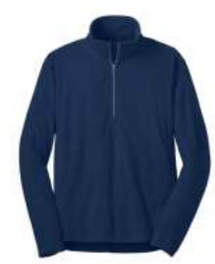
Port Authority® Microfleece 1/2-Zip Pullover