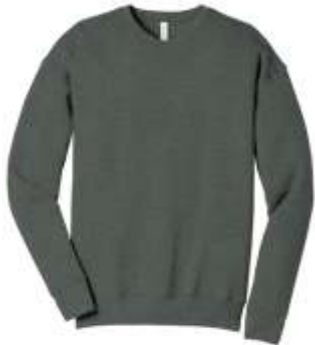
BELLA+CANVAS® Unisex Sponge Fleece Drop Shoulder Sweatshirt