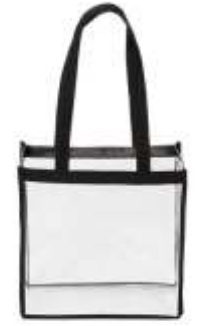
Port Authority® Clear Stadium Tote