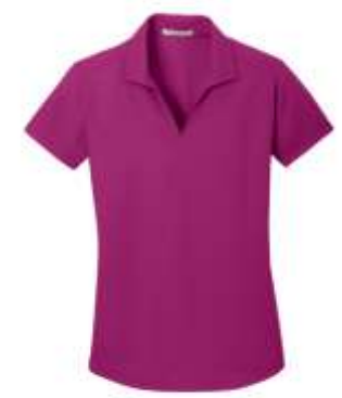
Port Authority® Ladies Dry Zone® Grid Polo