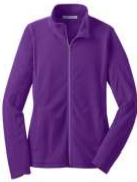
Port Authority® Ladies Microfleece Jacket