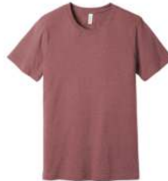
BELLA+CANVAS® Unisex Heather CVC Short Sleeve Tee