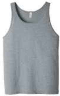
BELLA+CANVAS® Unisex Jersey Tank