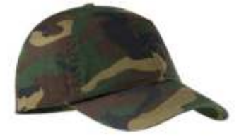
Port Authority® Silk Touch™ Performance 1/4-Zip