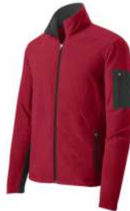
Port Authority® Ultra Warm Brushed Fleece Jacket