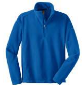
Port Authority® Value Fleece 1/4-Zip Pullover