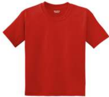
Gildan® - Youth DryBlend® 50 Cotton/50 Poly T-Shirt