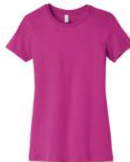
BELLA+CANVAS® Women's Slim Fit Tee