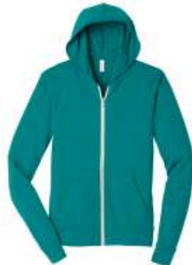
BELLA+CANVAS® Unisex Triblend Full-Zip Lightweight Hoodie