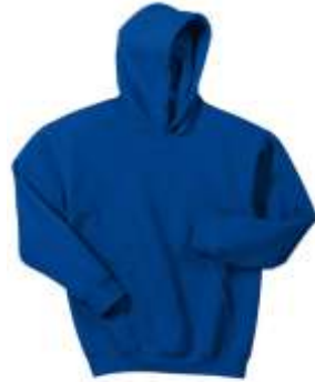
Gildan® - Youth Heavy Blend™ Hooded Sweatshirt

• 8-ounce, 50/50 cotton/poly • Double-needle stitching at waistband and cuffs • Double-lined hood • No drawcord at hood