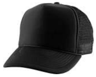
Classic Foam Front Trucker Hat