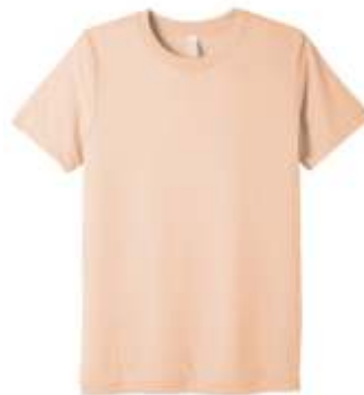
BELLA+CANVAS® Unisex Triblend Short Sleeve Tee