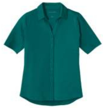
Port Authority® Ladies City Stretch Top