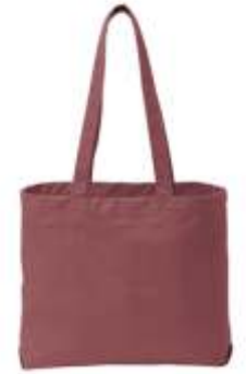
Port Authority® Beach Wash™ Tote