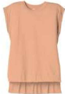
BELLA+CANVAS® Women's Flowy Muscle Tee With Rolled Cuffs