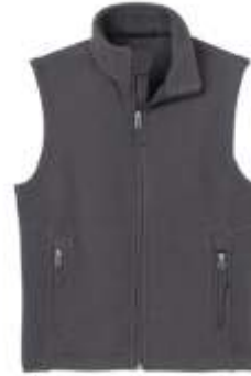
Port Authority® Youth Value Fleece Vest