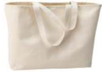
Port Authority® - Jumbo Tote