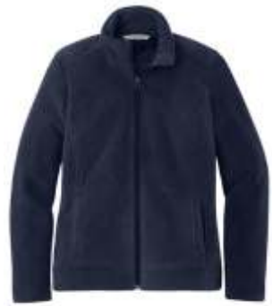
Port Authority® Ladies Ultra Warm Brushed Fleece Jacket