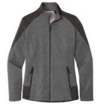
Port Authority® Ladies Grid Fleece Jacket