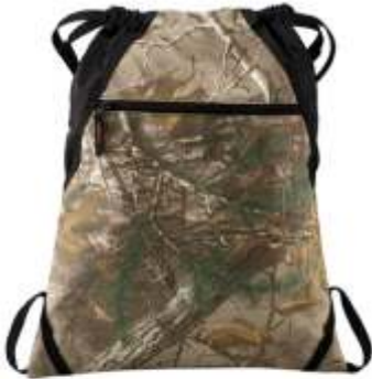
Port Authority® Outdoor Cinch Pack