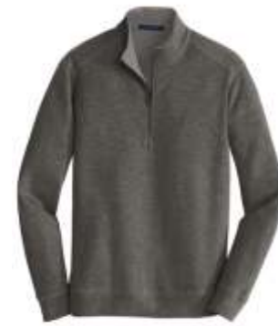
Port Authority® Interlock 1/4-Zip