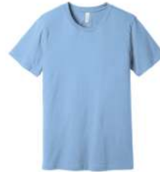
BELLA+CANVAS® Unisex Jersey Short Sleeve Tee