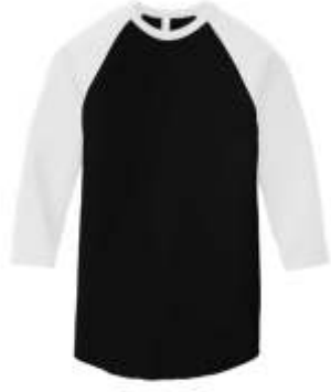
American Apparel® Poly-Cotton 3/4-Sleeve Raglan T-Shirt