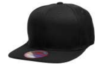
Wool Blend Snapback