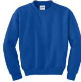
Gildan® - Youth Heavy Blend™ Crewneck Sweatshirt

• 8-ounce, 50/50 cotton/poly • Double-needle stitching at waistband and cuffs • 1x1 rib knit collar, cuffs and waistband with spandex