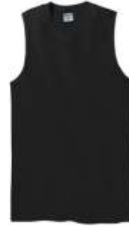
Gildan® - Ultra Cotton® Sleeveless T-Shirt